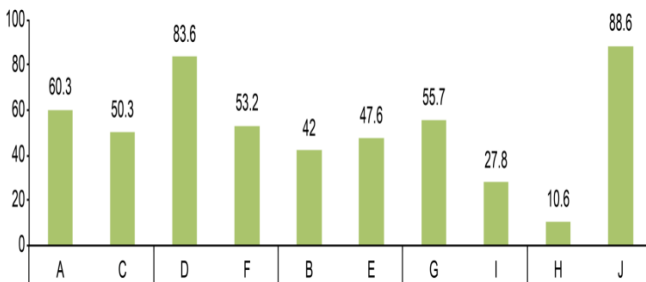
Figure 3. Results of the selection of skills in building the profile of the coach according to the leaders