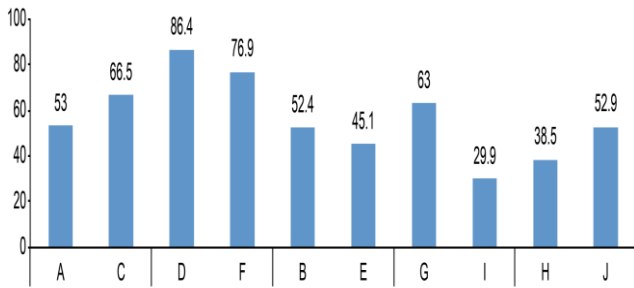
Figure 1. Results of the selection of skills in building the profile of the coach according to the Athletes