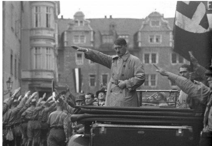
Figure 02: Hitler's famous salute.

✚ The "Heil Hitler" salute that is made by the Nazis added a powerful feature to his image in addition to his title "Der Führer" which means the leader.