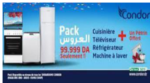
Figures 01: Condor.

The following two pictures (figures 01) and (figures 02) are about two famous enterprises in Algeria. The first picture is about the enterprise of 'Condor'. The picture presents a limit offer for a bride about a number of household appliances. The second picture presents the enterprise of mobile 'Iris', even though it is not an Algerian enterprise. But, it has a good feedback among Algerian customers.