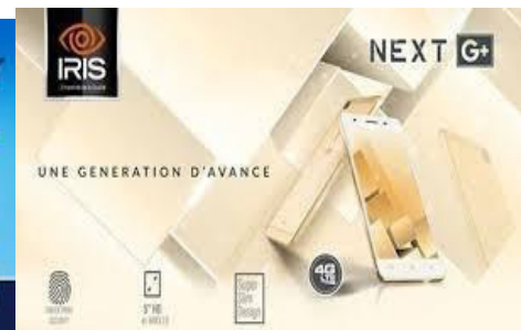
Figures 02: Iris.