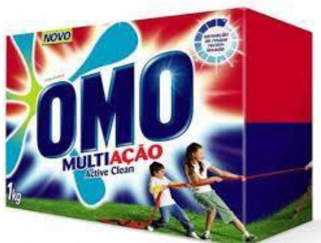
Figure 07: Washing powder OMO.

e.g. ?wmw ywasax hwayjo w ziyd yt ?alam howa lmofiyd.