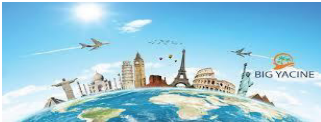
Figure 09: BIG YACINE ( voyage and tourism).

The previous advertising was coherence and cohesive in terms of events sequence and the sounds. For instance, if the advertiser adapts another sound for the crash. This will lead to a kind of misunderstanding. The events sequence and the sounds are a part of our daily life