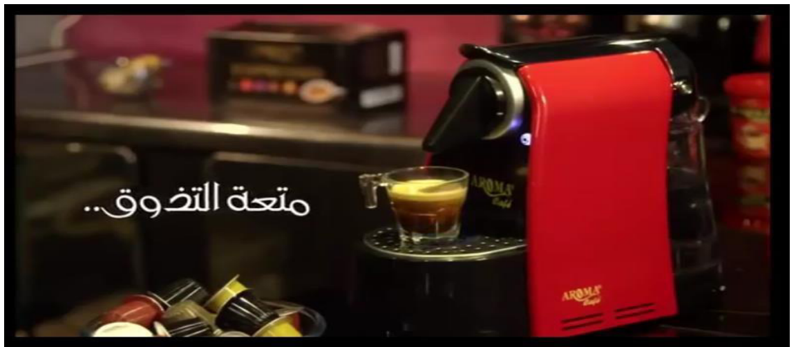
Figure 08: Coffee Aroma.

Despite the fact that pictures and music create a mood in advertising. But, the choice of language to convey a specific message with the purpose of influencing people is very important. So, let's consider the following samples.