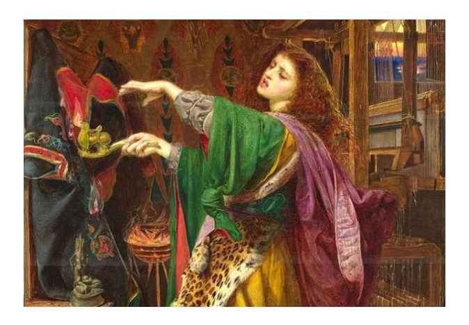
Figure 3: Morgan le Fay

Morgan le Fay: known by coral, she was studying the magic and learning by the magician "Merlin" who had a global reputation; he was guarding and serving the king Arthur. Coral practiced a kind of forbidden magic which called the black magic in order to overthrow the king and lose his throne.