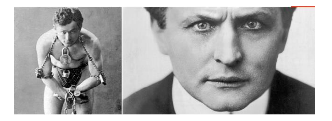
Figure 10: Harri Houdini