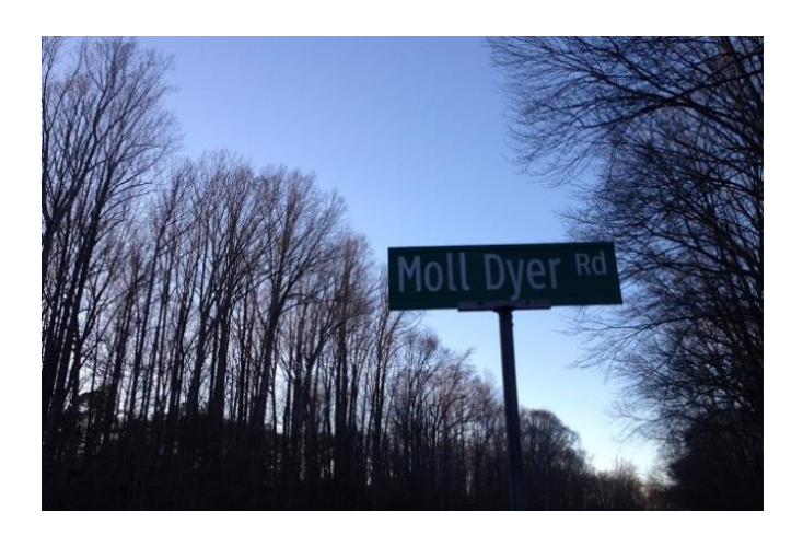
Figure 6: Moll Dyer

horror spread in the villages where the ghost of Mall Dyer was chasing them and it derived from this story film.