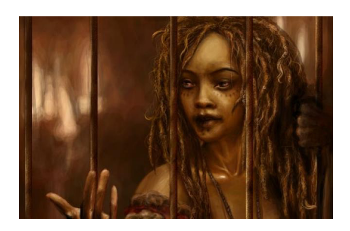
Figure 8: Marie Laveau

she has got the healing power, Marie used her power when visiting patients in New Orleans, died in 1881.