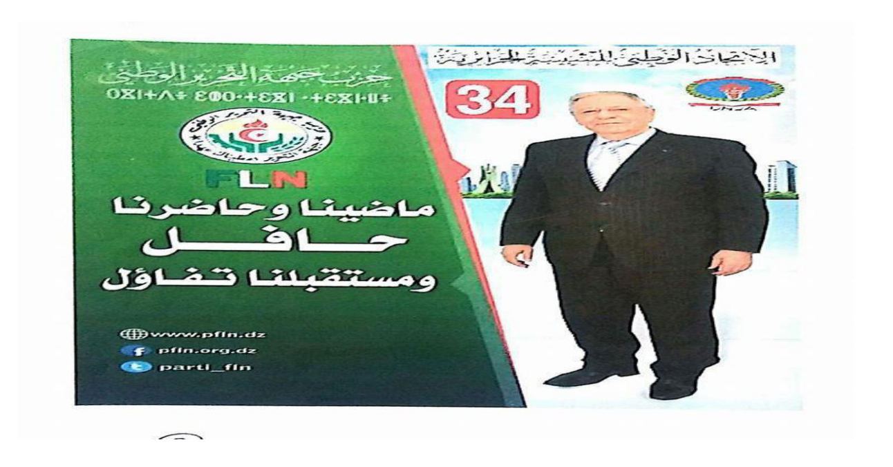
Figure 02: The political poster of Djamel Oueld Abbes of (FLN) during the political campaign in A Igeria 2017.

name's party; moreover, the slogan combines with Djamel's face which indicates to be optimist to have better future.