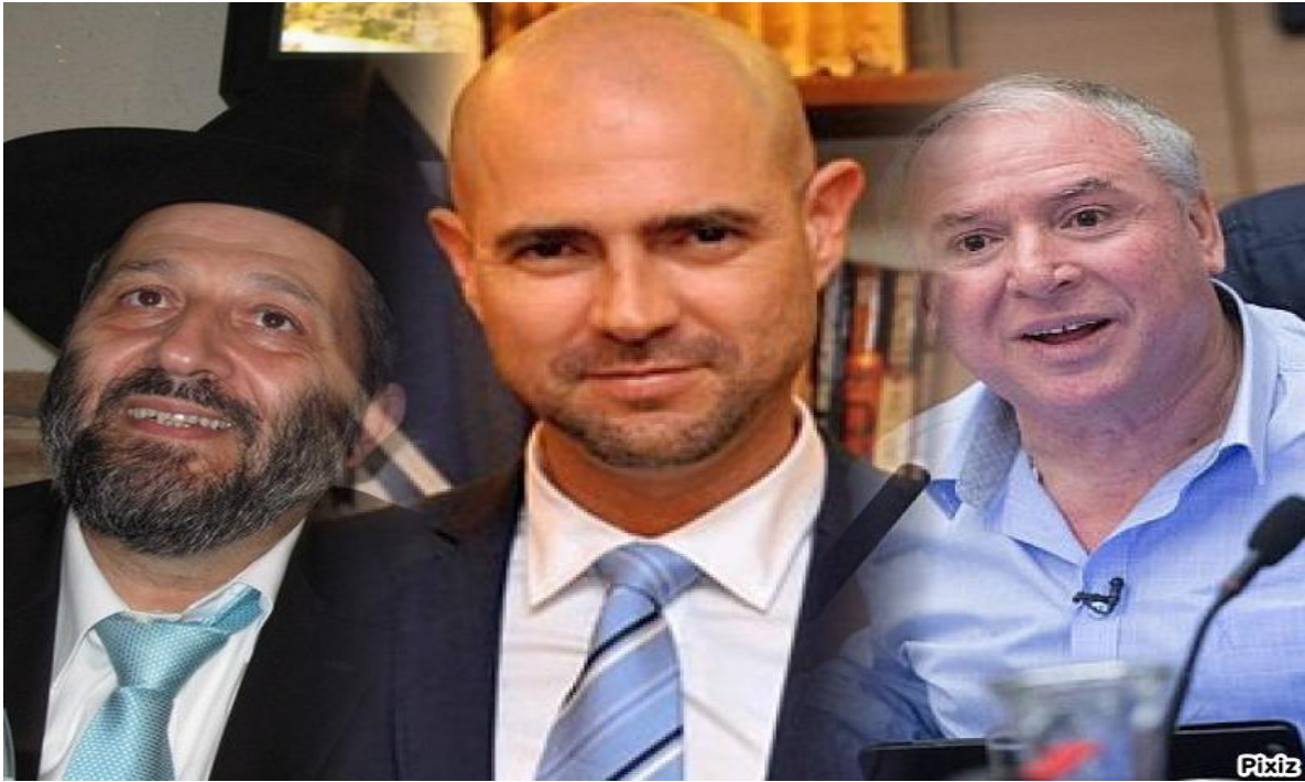
Man with high ranked positions in the occupied territories of Plaestine That are born in Morocco.